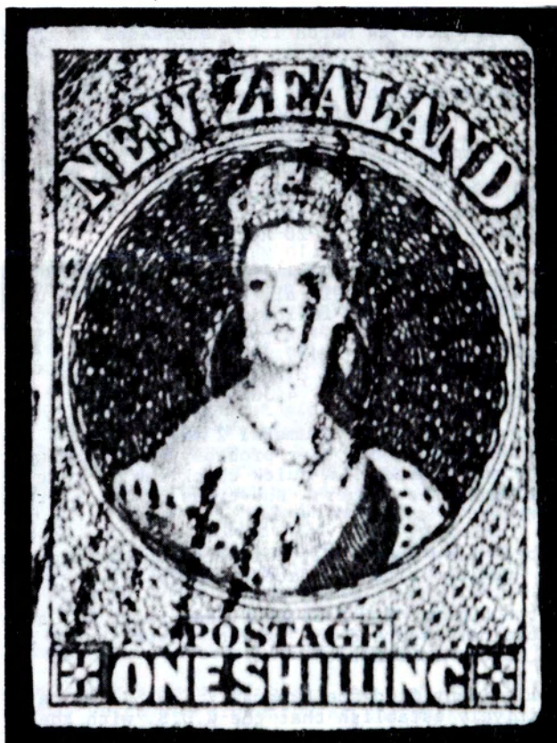
Lot 527 (c) 1/- PELURE PAPER