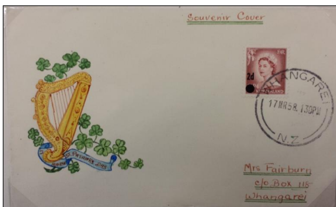
St Patrick's Day March 17 th (Souvenir Cover)

Date: March 17 th 1958 Ref No: 58/2A Image: paint/ink – multicoloured Size: 148mm x 91mm Addressee: Mrs Fairburn (handwritten - red) Comments: 2d provisional stamp postmarked Whangarei