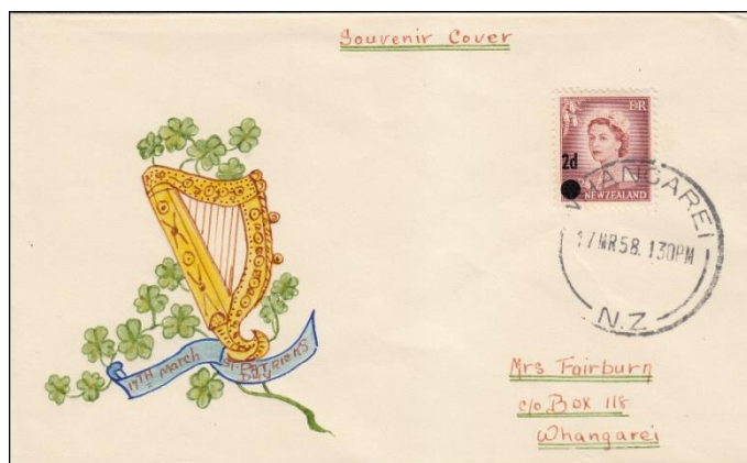
St Patrick's Day March 17 th (Souvenir Cover)

Date: March 17 th 1958 Ref No: 58/2A Image: paint/ink – multicoloured Size: 148mm x 91mm Addressee: Mrs Fairburn (handwritten - red) Comments: 2d provisional stamp postmarked Whangarei