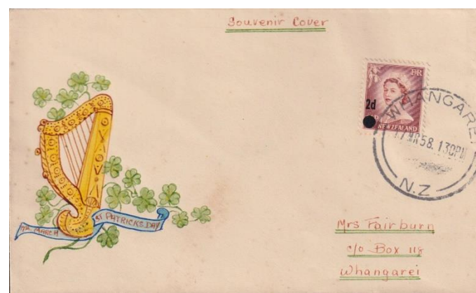
St Patrick's Day March 17 th (Souvenir Cover)