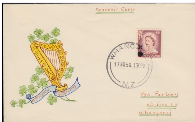
St Patrick's Day March 17 th (Souvenir Cover)