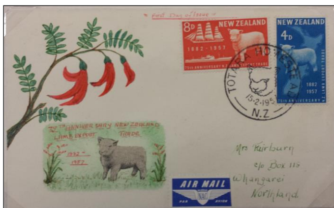
75 th Anniversary New Zealand Lamb Export Trade 1882 – 1957

Part 'Air Mail' Sticker in top left corner