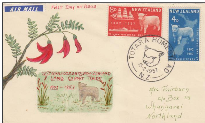
75 th Anniversary New Zealand Lamb Export Trade 1882 – 1957

Part 'Air Mail' Sticker in top left corner