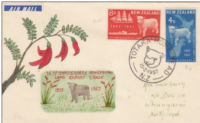
75 th Anniversary New Zealand Lamb Export Trade 1882 – 1957