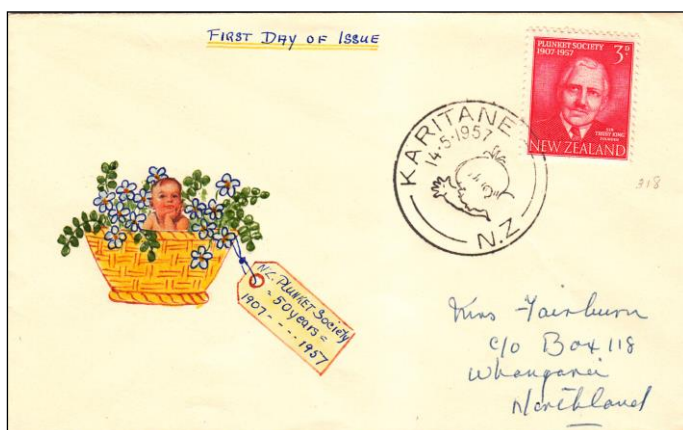
N.Z. Plunket Society